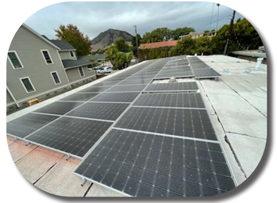
Solar Panels at our San Luis Obispo Health Center