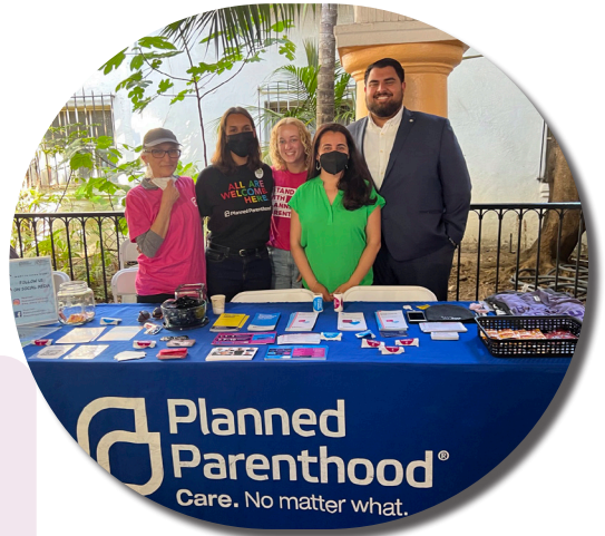
PPCCC tabling at Earth Day in Santa Barbara