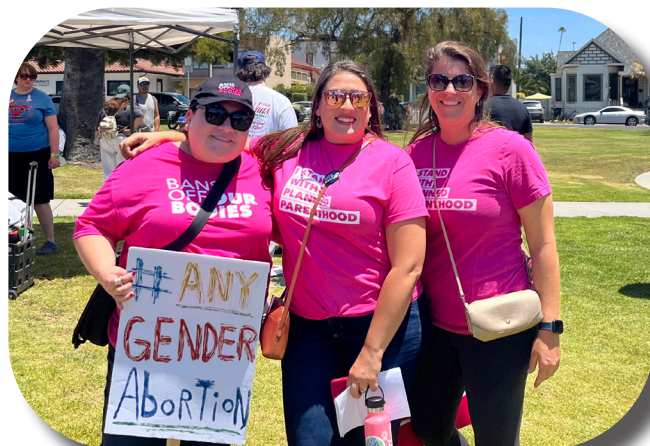
Supporters at our Ventura Rally on May 14, 2022

We have been doing this work for over 100 years, and we will never stop fighting until all people have the freedom and the power to control their own body and life.