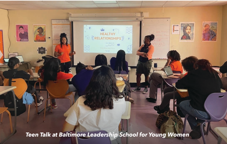
Teen Talk at Baltimore Leadership School for Young Women

Peer Educators are equipped with the tools to act as educational resources to their peers, represent PPM at events, and advocate for teen issues at the state legislature. In-person and virtual Teen Talks are facilitated by the Peer Educators and cover topics such as healthy relationships, consent, birth control, sexual orientation and gender identity, and more.