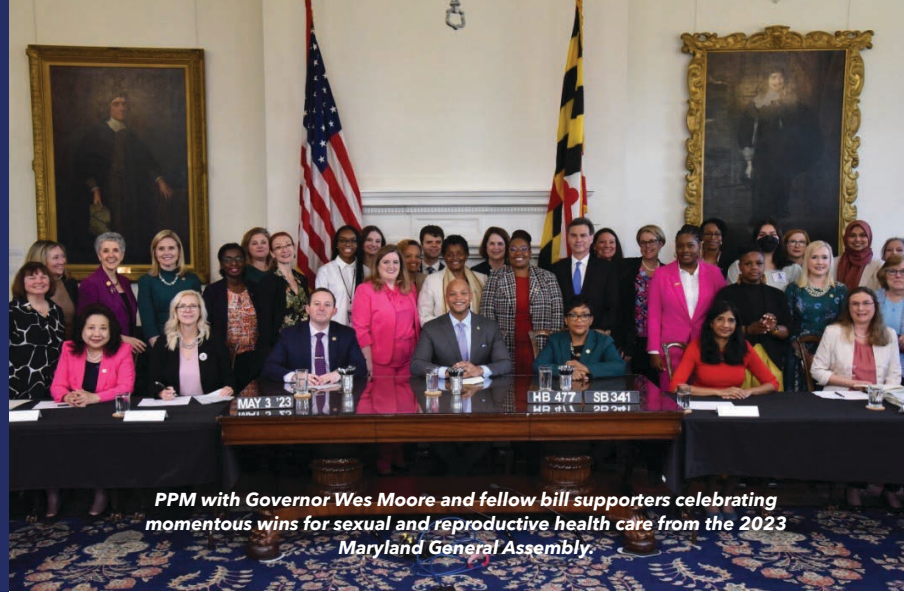
PPM with Governor Wes Moore and fellow bill supporters celebrating momentous wins for sexual and reproductive health care from the 2023 Maryland General Assembly.

To learn more about the 2024 ballot initiative, visit MDReproFreedom.com .