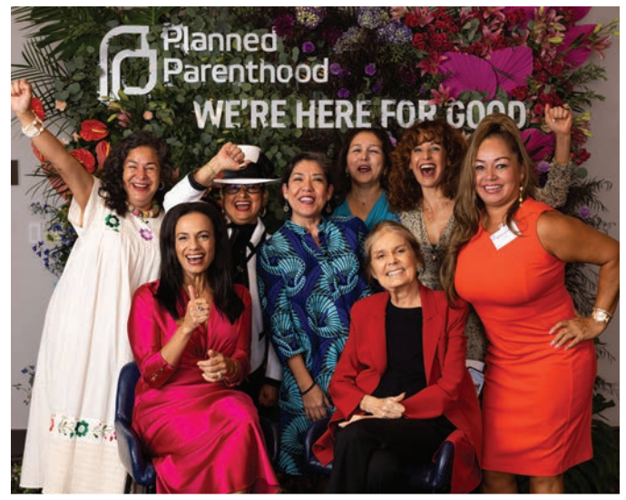
Gloria Steinem and fierce feminist friends

Planned Parenthood® Planned Parenthood South Texas