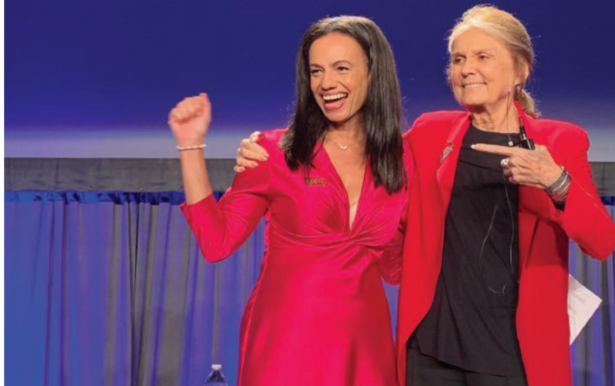
PPFA President Alexis McGill Johnson and feminist legend Gloria Steinem

Planned Parenthood® Planned Parenthood South Texas