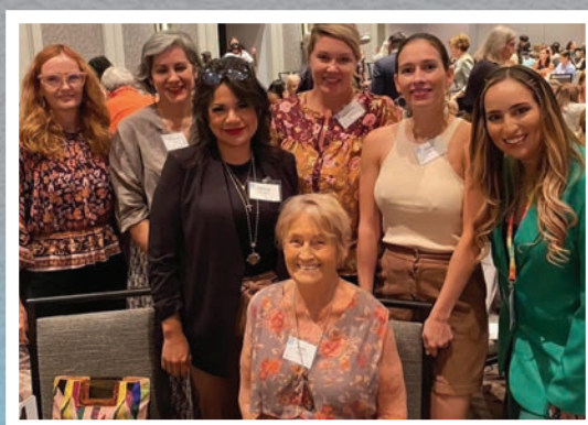
Supporters from the Rio Grande Valley