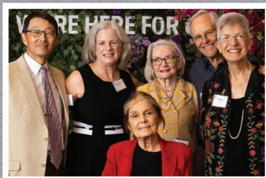
Gloria Steinem with Planned Parenthood supporters