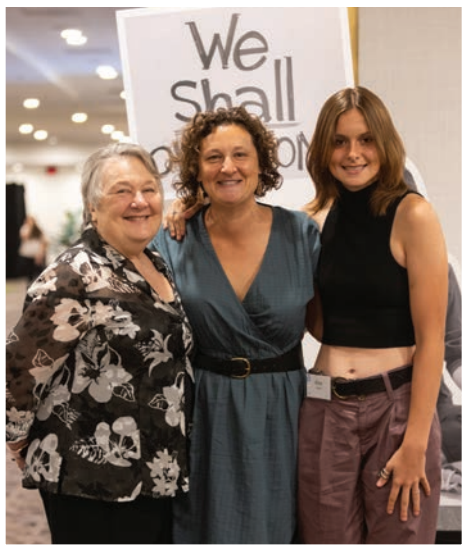
Three generations of supporters