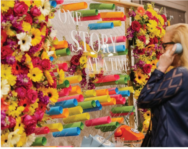
Hearing abortion stories at the story lounge