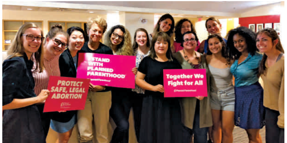
Members of the PPAF Speakers Bureau.

PPAF's Speakers Bureau started in 2015 with a small group of volunteers and has grown to include 20 speakers. All speakers participate in an intensive training about the