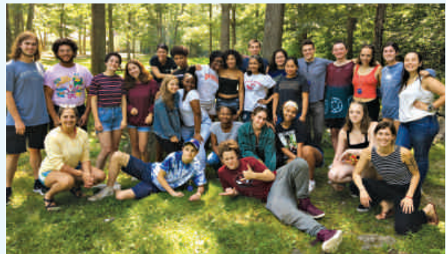
The 2019-2020 Boston and Worcester Get Real Teen Councils at a retreat in August.

Since the GRTC's launch in 2013, nearly 23,000 young people and community members have benefited from the program, and last year alone, 25 GRTC educators reached over 7,000 young people. But the program's impact extends well beyond workshops and professional trainings – many participants have gone on to publicly advocate for reproductive freedom, and GRTC members often find that their