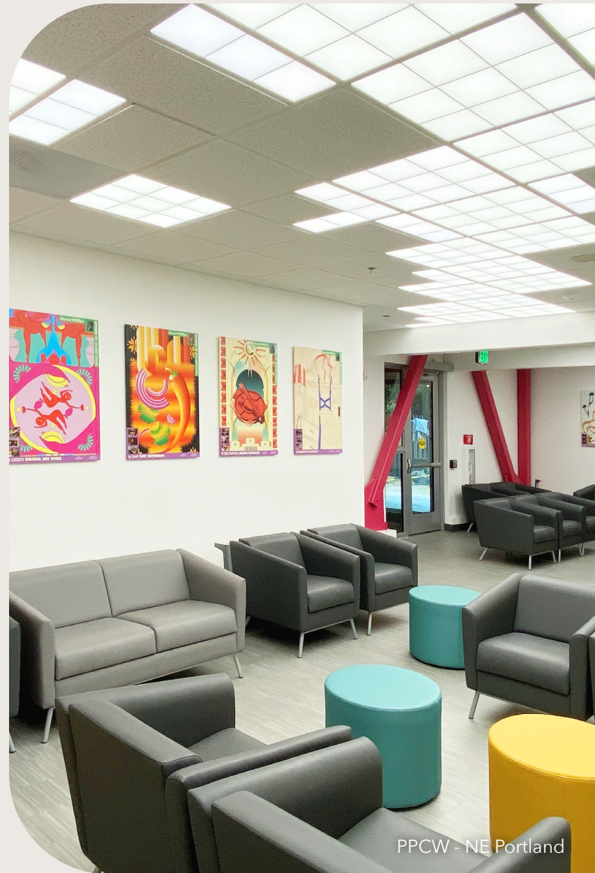
PPCW - NE Portland

Renovations at our Northeast Portland health center are complete.