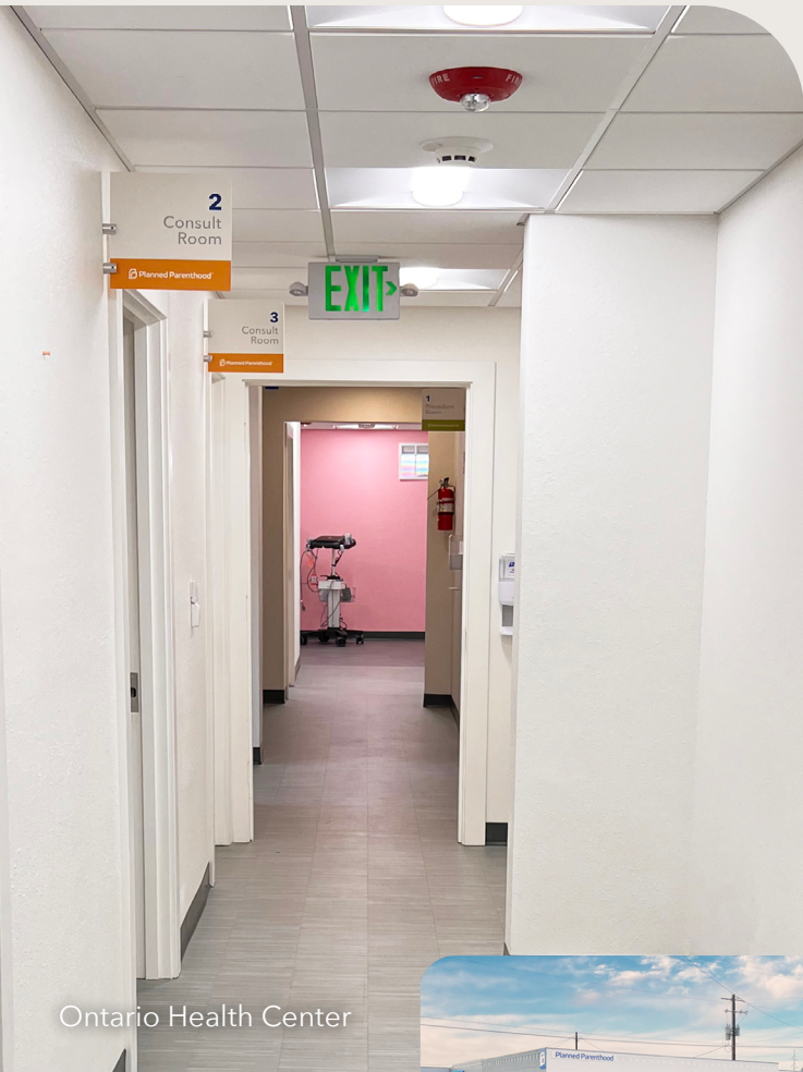
Ontario Health Center