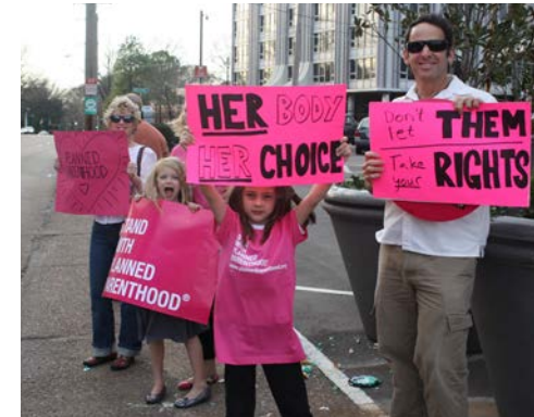
Above: PPGMR Supporters