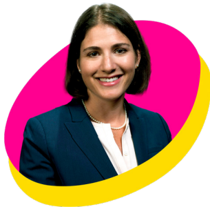
Assemblymember Buffy Wicks, 15th Assembly District

"With the right to abortion being stripped from people across the country, now more than ever, the critical work of health care champions like Planned Parenthood Northern California is the only way we can ensure access to abortion and to advance reproductive justice. As Chair of the Assembly Select Committee on Reproductive Health, I will continue to fight to protect the right to abortion care and I am proud to partner with Planned Parenthood Northern California to find meaningful ways to protect and expand access. I thank Planned Parenthood of Northern California for their essential work in delivering safe access to abortion and other health care to our communities."