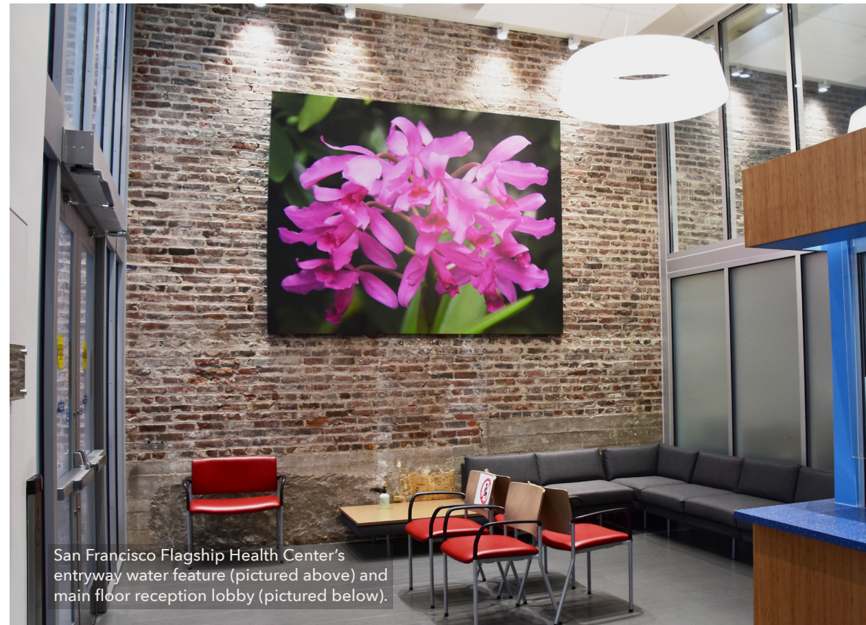
San Francisco Flagship Health Center's entryway water feature (pictured above) and main floor reception lobby (pictured below).