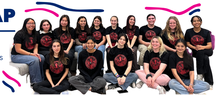
2022-2023 Peer Advocates Cohort

Honest conversations about sexual health can be challenging for youth as well as their parents and teachers. One way PPPSGV helps bridge this information gap is through our youth-led education program, Peer Advocates. With our guidance, local high school students become knowledgeable and approachable sexual health advocates. They field sensitive questions from classmates around topics like accessing birth control, expressing their gender identity, and more. The Peers also learn how to use their collective voice to create change around sexual health issues directly affecting their communities. This work includes surveying hundreds of young people about sexual health topics and using this data to inform community impact projects.