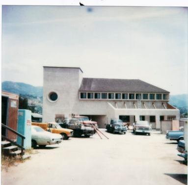
PP/SB Katharine Gray Center May 25, 1978

Throughout our 60 years we saw major expansions of access - including the legalization of birth control and abortion. In 1973 abortion became federally protected with the Roe v. Wade decision, and in 1979 we added this important service to the long list of services we provided.